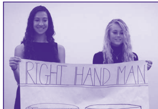
Team members presenting their marketing to the Advertising Judges.