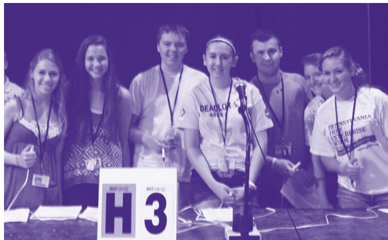
Company H3 prepares to buzz in for the always competitive "Biz Quiz" activity.