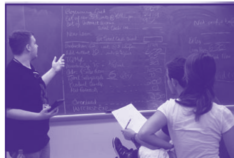
Going over their figures before the Stockholders' presentation!