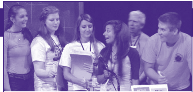
Students test their knowledge in the “Biz Quiz” game.

Each of our four weeklong PFEW sessions gives our young “management team members” a chance to experience the excitement of competition within the free market system in addition to learning about the system and how businesses operate within it. Each and every PFEW graduate is a winner, but we give special recognition to the student companies (and their Company Advisors) who raised the bar during each week.